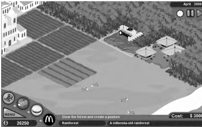
Figure 1.1 In Molleindustria's The McDonald's Game , players must use questionable business practices to increase profits.

grazing (see figure 1.1). These tactics correspond with the questionable business practices the developers want to critique. To enforce the corrupt nature of these tactics, public interest groups can censure or sue the player for violations. For example, bulldozing indigenous rainforest settlements yields complaints from antiglobalization groups. Overusing fields reduces their effectiveness as soil or pasture; creating dead earth also angers environmentalists. However, those groups can be managed through PR and lobbying in the corporate sector. Corrupting a climatologist may dig into profits, but it ensures fewer complaints in the future. Regular subornation of this kind is required to maintain allegiance. Likewise, in the slaughterhouse players can use growth hormones to fatten cows faster, and they can choose whether to kill diseased cows or let them go through the slaughter process. Removing cattle from the production process reduces material product, thereby reducing supply and thereby again reducing profit. Growth hormones offend health critics, but they also allow the rapid production necessary to meet demand in the restaurant sector. Feeding cattle animal by-products cheapens the fattening process, but is more likely to cause disease. Allowing diseased meat to be made into burgers may spawn complaints and fines from health officers, but those groups too can be bribed through lobbying. The restaurant sector