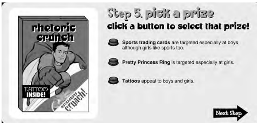
Figure 1.2 PBS’s Freaky Flakes offers a simple representation of practices of children’s advertising.

The argument Freaky Flakes mounts is more procedural than Retouch , but only incrementally so. The user recombines elements to configure a cereal box, but he chooses from a very small selection of individual configurations. Freaky Flakes is designed for younger users than Retouch , but the children who watch PBS Kids also likely play videogames much more complex than this simple program. Most importantly, Freaky Flakes fails to integrate the process of designing a cereal box with the supermarket where children might actually encounter it. The persuasion in Retouch reaches its apogee when the user sees the already attractive girl in the fake magazine ad turned into a spectacularly beautiful one. This gesture is a kind of visual enthymeme, in which the